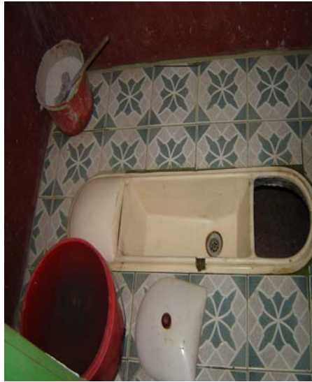
Figure - 2 Photograph of Interior View of Ecosan Latrine