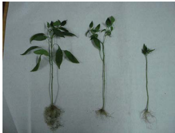
Figure -4 Photographs of the chili plants

That is, the quality of the compost derived from Ecosan latrine varies depending on what extra ingredients are added to the pit, in addition to excreta (Morgan, 2004). Sri Lanka is an ideal location for composting due to warm weather and moist tropical air (Berger, 2004). Commercial fertilizers can be replaced by sanitized humus from Ecosan Latrines with little or no extra cost.