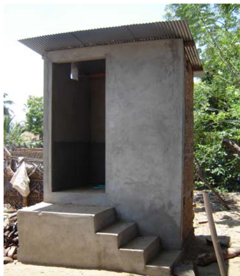
Figure -1 Photographs of Ecosan Latrine

Key objectives of the study is to compare the quality of compost products of latrine composting with the bin composting in terms of N:P:K value aligned with the survey on knowledge, attitudes and practices of the usage of both systems. The results are expected to provide reliable facts for upgrading the ecological sanitation and usage of compost produced by Ecosan latrines. This study contributes to this aspect, by emphasizing the social concerns with respect to the knowledge, attitudes and practices of the users.