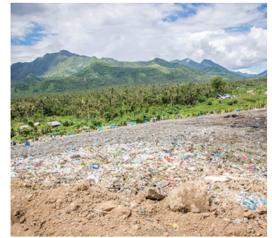
ABOVE: The Tacloban City Septage Site fell into extreme disrepair with the lack of consistent management and exposure to extreme weather conditions such as Typhoon Ruby in December of 2014.