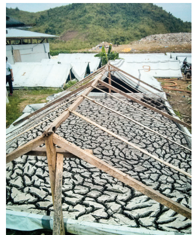
ABOVE: One of two emergency waste management sites in Yolanda-affected areas was located in the Municipality of Palo, Leyte. Mixing cells were constructed using coconut lumber (FAR LEFT), lined with plastic, filled with fecal sludge and mixed with lime (LEFT CENTER); the waste was then pumped (RIGHT CENTER) to one of many drying beds (FAR RIGHT) to conclude treatment.