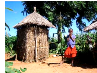
Toilets That Make Compost Low-cost, sanitary toilets that produce valuable compost for crops in an African context