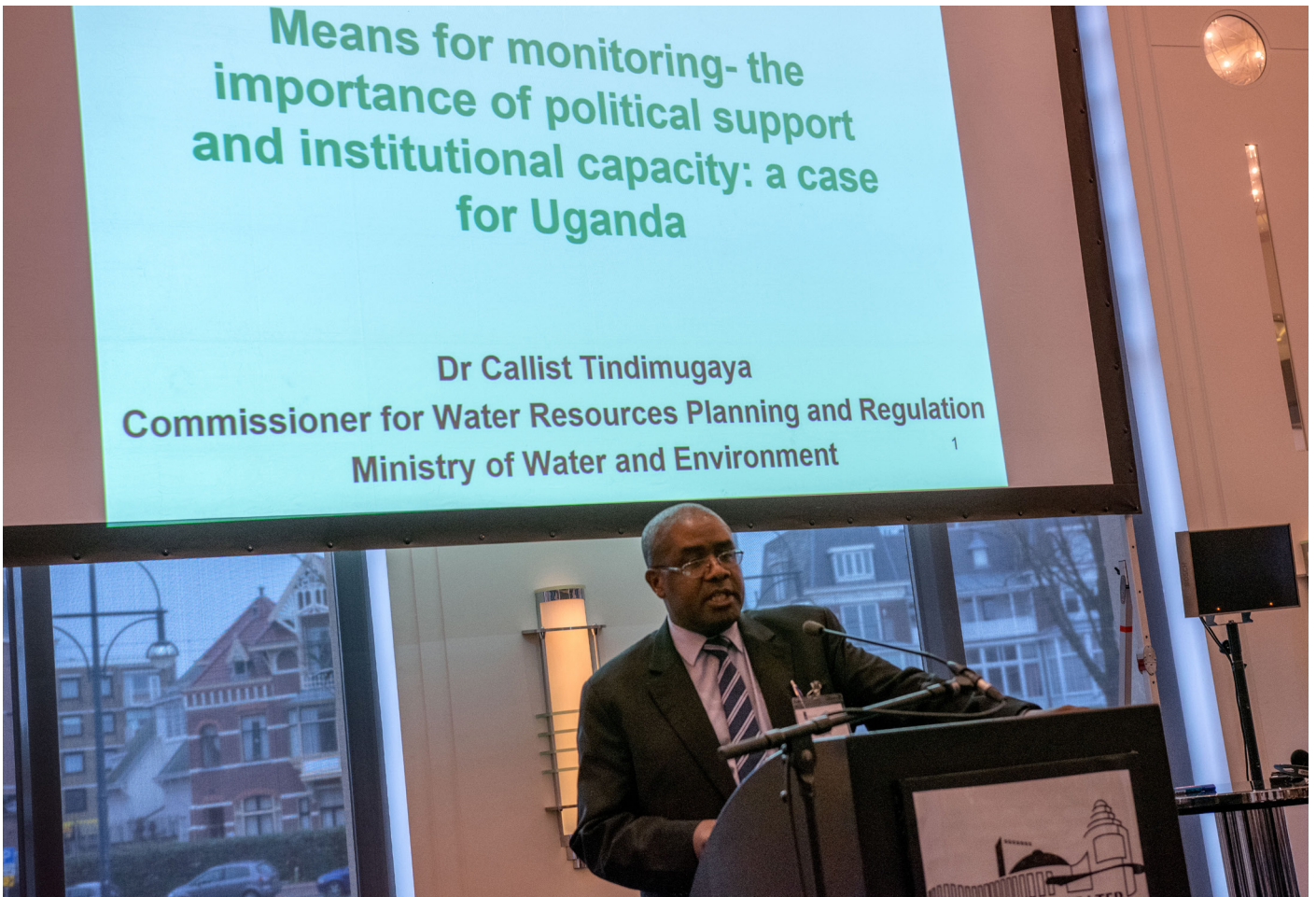
Uganda and Peru delivering their case studies