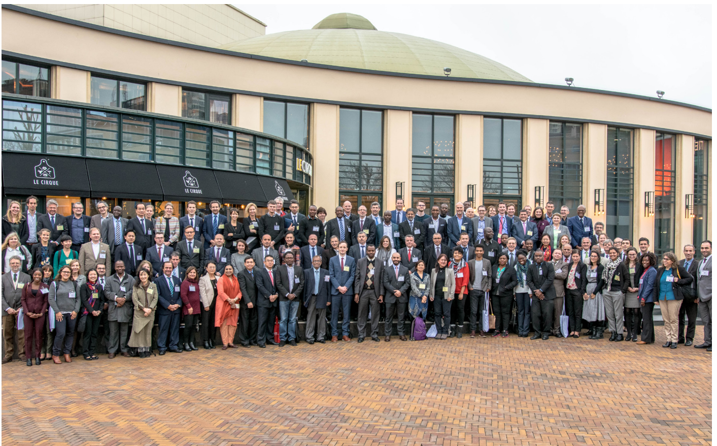
Group Photo - workshop participants