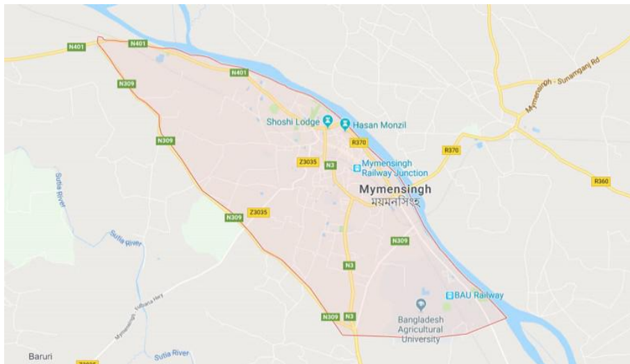
Figure 1: Map of Mymensingh City Corporation

Mymensingh is governed by Mymensingh City Corporation which comprises of 21 wards. According to data from 2017 the total population of Mymensingh City Corporation is about 478,889 (Male- 217,132 and Female- 239,469), the population density is 1,163/Sq Km and the annual growth rate is 1.28%. Average minimum temperature of Mymensingh town is 11.8°C and average highest temperature is around 33°C. It is located in an area of relatively high rainfall with the annual rainfall ranging from 1,711 mm to 4,166 mm (average 2,666 mm). Mymensingh City Corporation (MCC) provides supplied water in many of its areas and those out of water supply network depend on their own sources for collecting water.