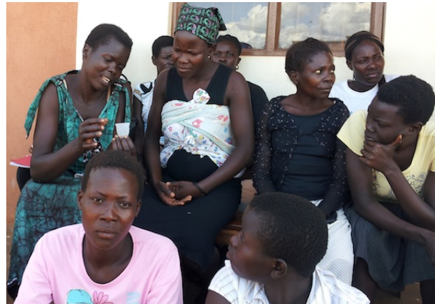
Questions & answers session at follow up.

The most common challenge in cleaning the cup was lack of a private place to clean it (38%, n=8) and fear that others will see their menstrual flow (24%, n=5). One mentioned boiling the cup as a "minor problem", because she has to boil it in public (outside her hut). Several mentioned that they did not like boiling the cup in a pot that is used by others for e.g. cooking food and they therefore instead pour boiling water over their cup in their washing basin. One mentioned it is difficult to clean when visiting others, and she would therefore empty the cup before going somewhere without facilities to empty/clean the cup.