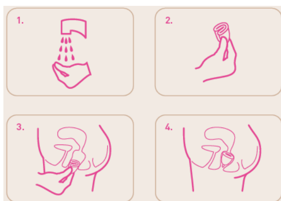
Insertion of a menstrual cup in the vagina/Ruby Cups

The few studies available on use of menstrual cups from high-income settings indicate that health risks are minimal if used as directed. 4-7 Although there has been one reported case of a retained cup requiring medical intervention, 8 and suspected associations between use of cups and dislodged intrauterine devices, endometriosis and adenomyosis, 9, 10 documented cases are few and the associations have not been systematically evaluated. Available evidence from diaphragm trials, and a menstrual cup trial in urban and peri urban Nepal suggest limited risk of reproductive tract infections caused by use of cups in low-income settings. The Ministry of Health in Uganda is considering integrating menstrual cups in the management of obstetrical fistula and is currently (2012) piloting a study on this subject. However there are few studies on the use of menstrual cups and health risks in these settings, hence the rationale for this pilot study.