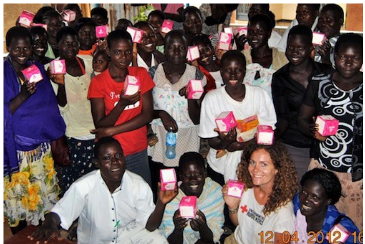
Distribution of menstrual cups to study participants at baseline.

The information provided in the beginning emphasizing hand washing and hygiene practices seems effective and appears to have successfully deterred study participants from sharing their cups. The curriculum can be shared with other programs.