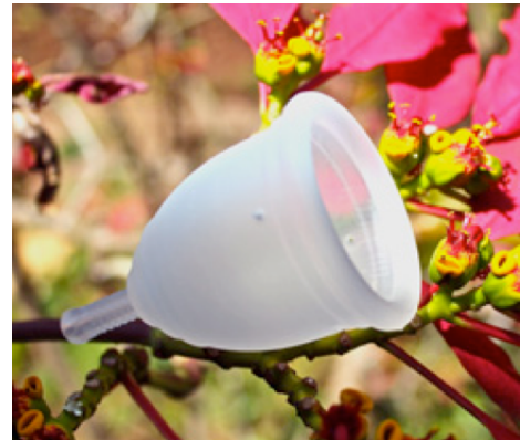
Ruby Cup (menstrual cup brand)

The menstrual cup is increasingly being considered as a possible way to improve the menstrual management of poor women and young girls in low-income countries, reflected by ongoing studies in e.g. India, Kenya and Nepal*. The menstrual cup is a bell-shaped cup most often made of medical silicone (a few brands are made of rubber or Thermoplastic Elastomer (TPE)) and is worn inside the vagina during menstruation to collect menstrual fluid. 4 The menstrual cup can collect three times as much fluid as the average tampon can absorb. It can be washed and reused up to 10 years. The menstrual cup has thus the advantage of being economical, reusable, and environmentally friendly. 4