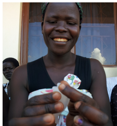
Questions & answers session.