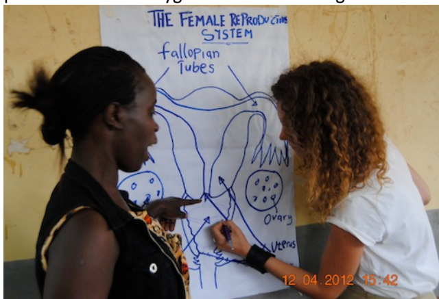
Training session on use and cleaning of menstrual cups.

The study had in total 31 female participants: 23 female beneficiaries from the LPS project (who had completed all LPS sessions) and 8 URCS volunteers/staff. Participants attended a half-day training session facilitated by a member of WoMena, who was working for the LPS project at the time, on hygienic use and cleaning of the menstrual cup. The training was designed to suit the LPS curriculum on menstruation and menstrual management, and had special emphasis on the importance of sterilization of the cups in-between periods and hand hygiene when inserting and removing the cups. This was inspired by the APHRC study from