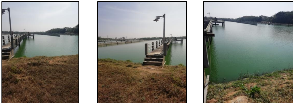
Figure 3: Three different views of the 60 MLD STP based on facultative aerated lagoon pond technology in Rayanakere H.D.Kote road, Mysuru.

At present, the sewage generated from the drainage district E is let out into storm water drain which ultimately joins the nearby tank. All the sewage treatment plants are based on old technology (facultative aerated lagoons) (FO, 2019). Small industries have their own wastewater treatment plant. After the treatment, the effluent is discharged into the Kaveri River and agricultural lands. The sludge is dumped in the STP premises (KII5, 2019). In 2014, around 60% of the sewage generated was being connected to the STPs and the remaining 40% had not been connected to the STPs and was left into the storm water drains which ultimately reaches the natural valley (AAP, 2014). In 2018, around 74% of wastewater is treated through STPs (KII2, 2019).