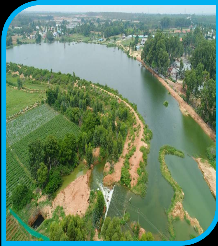
UDDAPANA HALLI -TANK