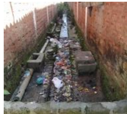
Figure 1: Open drains in slum area of Tinsukia

Around 1% (T1A1C6) of the population are connected to toilet discharges directly to open drain i.e. Night Soil disposed in Open Drain (NSOD) 9 . This can be majorly attributed to the presence of poor toilet infrastructure in the slum areas located within the municipal boundary 9 .