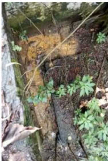
Figure 2: Night Soil discharged directly into open drains

There is no sewerage network in Tinsukia 7 . The city is completely dependent on On-site Sanitation Systems (OSS) which may or may not be connected to open drains. The effectiveness of open drains are reduced due to indiscriminate dumping of solid waste and encroachment at different locations of the city. River Dibru (on the north) and river Tingrai (on the south) cater to the run-off from the municipal boundary 8 .