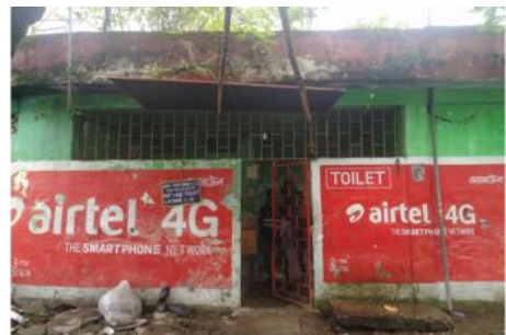
Figure 6: Public Toilet in Ward no. 10