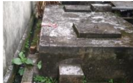
Figure 3: Septic Tank (3-chambered) in Ward no. 9

The average size of septic tanks in community toilet is 3.0 x 1.8 x 2.1 m and the average size of septic tanks in public toilet is 1.8 x 1.2 x 2.4 m which is manually emptied in 2-3 years 14 .