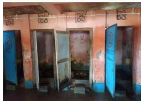
Figure 5: Community Toilet in Ward no. 13 (Vikash/CSE/2020)