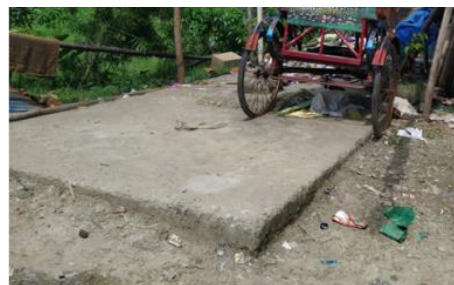
Figure 4: Septic Tank (3-chambered) in Ward no. 13 (Vikash/CSE/2020)