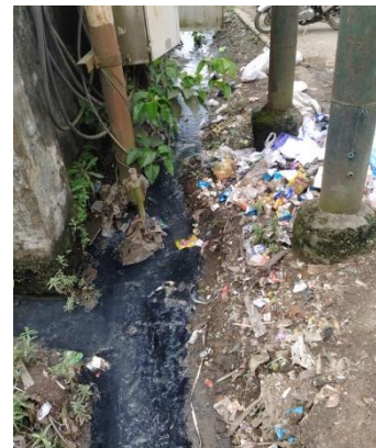
Figure 8: Faecal sludge discharged into open drains

The open drains carrying faecal sludge is conveyed into big drains/nullahs which ultimately ends up in River Dibru (on the north) and River Tingrai (on the south) 20 . Also, some of the drains overflow into open grounds, ponds or are stagnant, owing to blockage or encroachment 20 . Therefore, variable F4 & S4e is considered 0% in SFD matrix.