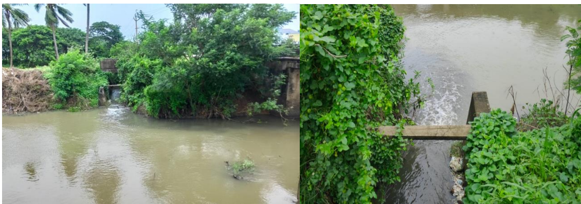
Figure 5: Storm water drains ending up in the drainage canal near Mandapeta- Alamuru road

Treatment/Disposal: There is no Faecal sludge treatment plant (FSTP) and Sewage treatment plant (STP) in the town. Therefore in the absence of such provision, the private emptier discharge the faecal sludge in open drains, nullahs etc. Since there is no proper treatment of emptied faecal sludge, F5 & S5e is considered 0% in SFD matrix. Municipality has given a proposal for FSTP in Veerabhadrapuram area in upcoming years (KII-1, 2020).