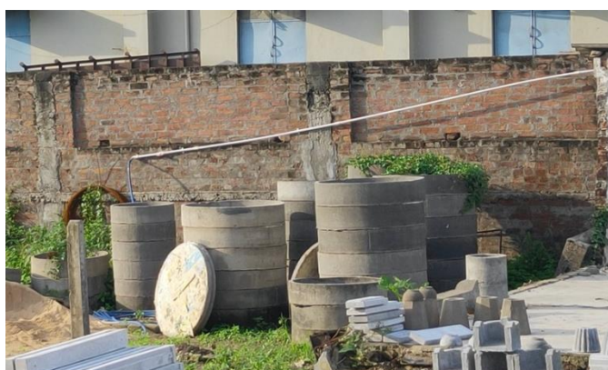
Figure 1: Cement Rings used for lined pits

Containment: Based on sample household surveys, KIIs and FGDs with relevant stakeholders, it was concluded that 100% population is dependent on the On-site Sanitation Systems (OSS). The prevalent OSS in the city are septic tanks connected to open drain (T1A2C6, 57%), fully lined tank (sealed) connected to open drain (T1A3C6, 23%) and lined pit with semipermeable walls with open bottom no outlet or over flow where there is significant risk of ground water pollution (T2A5C10, 20%).