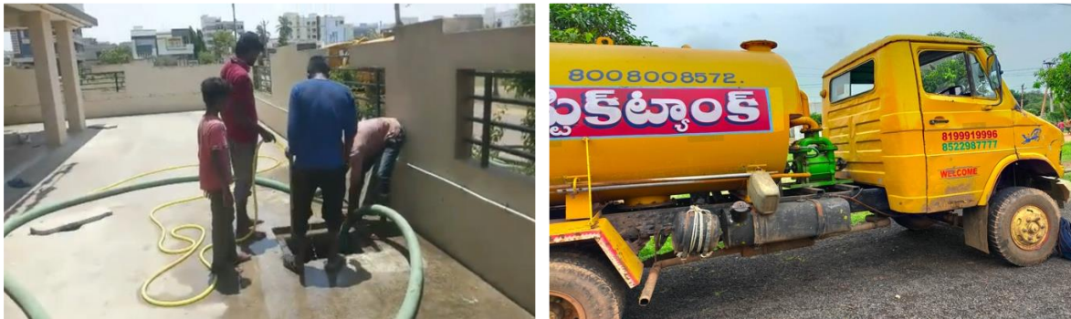
Figure 3: Emptying process in household through private truck mounted vacuum tanker

The private emptiers are not provided with Personal Protective Equipments (PPEs) (FGD-2, 2020). There are no instances of manual scavenging found in the city (Field observation, KII-2, 2020)