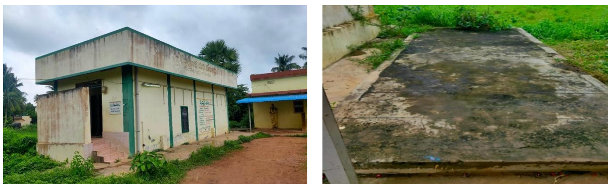
Figure 2: Community toilet (left) and Septic tank in community toilet (Right)

Community Toilets/Public Toilets: There are 1 public toilet and 10 community toilets across the town which are constructed under Swachh Bharath mission (SBM,2016). About 353 households which do not have individual toilet facility due to low income settlement and insufficient space are mostly dependent on community toilets (Field observation; KII-6, 2020). Separate toilet facilities are provided for men and women in all community toilets (Field observation; KII-1, 2020). These community toilets are well maintained by co-operative society (Field observation; KII-6, 2020). Community toilets and public toilets are connected to septic tanks whose outlet is connected to open drain (Field observation; KII-5, 2020). The average size of septic tanks in community toilet and public toilets is 4 x 3 x 3 m.