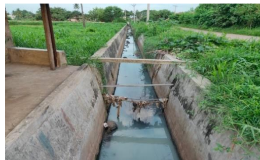
Figure 4 : Wastewater & supernatant flowing in storm water drain

Transportation: The emptied faecal sludge is transported through truck mounted vacuum tankers in around 2 trips per day (FGD2, 2020). The emptied faecal sludge is discharged into the drainage canal where open drains and storm water drains end (Field observation; KII-3, 2020). The drainage canal travels 33 km in mid way, receiving wastewater from surrounding towns and villages and without any pre-treatment, ends up near Coringa wildlife sanctuary and Mangroove forest near the mouth of River Godavari (Field observation; KII-9, 2020). Therefore, variable F4 & S4e is considered 0% in SFD matrix.