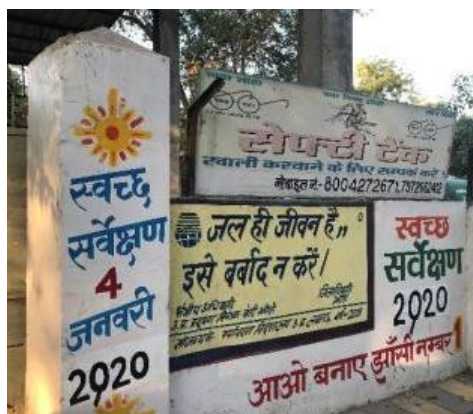
Figure 8: Advertisement done for emptying & transport of Faecal Sludge services by Private Partner (Harsh/CSE, 2020)

Due to narrow and congested roads in central Jhansi, it was observed that manual emptying is still prevalent (old city). Manual emptiers usually work in a group of 3-4 and charges INR 600 to INR 1000 per feet depth of the tank (FGD-3, 2020). Considering all the prevalent condition of the city and the resources available for providing emptying services, it is assumed that 50% of households are emptying their containment systems on time for the preparation of the SFD graphic (F3 in SFD Matrix)