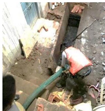
Figure 7: Emptying operation in Process by Poorna Pro Operator.

Transportation: JNN has two functional vacuum trucks of capacity 6000L and 1500L which are operated and maintained by private partner. The desludging vehicles or vacuum trucks are equipped with a motorized pump, storage tank and a 200 ft. long hose to access narrow roads and congested areas (figure- 9). These vehicles cover a distance of 9-11 km per trip and the average time taken for removal and discharge of FS is 1 hour (field observation). As per the views of JNN official, two vacuum trucks are enough to meet the emptying requirement of Jhansi city 18 . Faecal sludge being emptied by a vacuum truck is transported to the FSTP which is located 11 km from the city centre (JNN office). In KII with vacuum truck driver, it was told that the average time taken for removal and discharge of FS takes about 1.5 hours to 2 hours with exceptions of HH in congested area where it can take as long as 4 hours (KII-7, 2020).