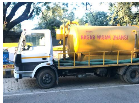
Figure 9: Vacuum Trucks 1500 L and 600 L owned by JNN

As mentioned before, there is no functional sewerage system in Jhansi. The supernatant from onsite sanitation systems and grey water generated from households is transported by open drains and discharged into agricultural fields or laxmi talab 19 . There are also instances reported of faecal sludge emptied by manual emptiers and discretely dumped into any nearby open drain 20 .