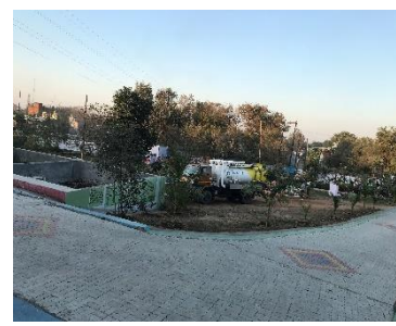
Figure 3: Emptied FS is disposed at FSTP Bijoli, Jhansi

There is no sewage treatment plant in the city. The untreated wastewater is discharged into open drains and which ultimately lead to Pahuj river.