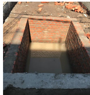
Figure 5: Fully Lined tank under construction

Out of this 98% population dependent on OSS, 54% have fully lined tanks (FLTOD) (figure- 3). Mostly these tanks were either in square shape or rectangular shape. 38% of the population are dependent on septic tanks (STOD) which were 2-3 chambered tanks. It could be observed from field survey and HH survey that the septic tanks cannot be called as contained systems as they are connected to open drains (field observations). Since there is no monitoring or standardization being followed in the construction of containment system by ULB, the usual practice is to construct very large capacity