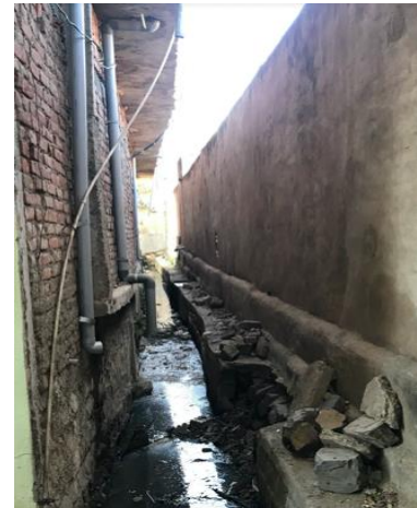
Figure 2: NSOD in Datiya gate (bahar)

As per interview with KII-1 and KII-5 there are no sewerage network in Jhansi city 5 . However, in field observation and HH survey it was found that there are certain wards in central Jhansi area where household toilets are directly connected to open drains (ward 15, 9 and 12). There are some gated societies in the city which are connected to Decentralize Wastewater Treatment systems. However, the population dependent on these system is very less and hence not considered in this SFD 6 .