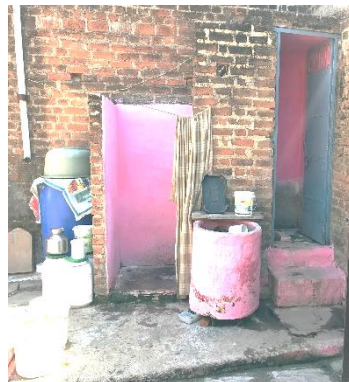
Figure 4: Toilets in LIG HHs