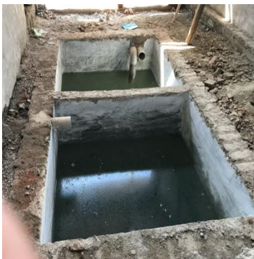
Figure 3: Septic tank under construction

Containments: In Jhansi, the excreta generated is collected in onsite containment systems which are connected to open drains. As per field observation, Key Informative Interviews (KIIs) and Focus group discussions (FGDs) with relevant stakeholders such as ULB officials, masons, desludging service providers and ward members, 98% of the population is dependent on Onsite Sanitation Systems (OSS) 7 . The two most prevalent OSS in Jhansi are Fully Lined tank connected to open drain (FLTOD) and Septic tanks connected to open drains (STOD) (field observation, 8