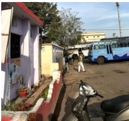
Figure 6: Public Toilet Bus Stand- Person Urinating in Public