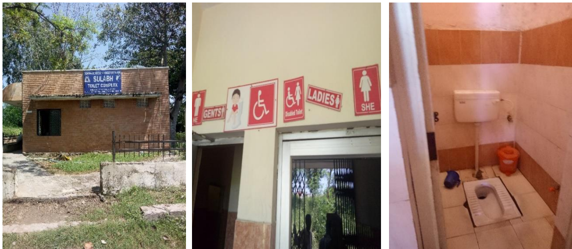
Figure 4: Public Toilets in Jammu City

The private emptiers usually charge between INR 1500 - 1800 per trip based on the size of containment and service area 30 . Most of private emptiers operate from Gangyal and Baribrahmna area in the outskirts of the city 31 . The emptying frequency for households varies from 3 to 4 years (demand based) depending upon the nature and the size of containment system. While for public and community toilets, the emptying is done once in every 3-6 months 32 .