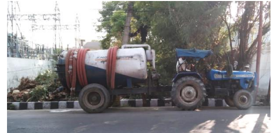
Figure 5: Private tractor mounted vacuum tanker

Transportation: The emptied faecal sludge is transported using truck/tractor mounted vacuum tanker in around 1-2 trips per day 35 . These vacuum tankers cover a distance of 3-5 km per trip on an average 36 . The time taken for emptying and discharge of FS is one hour on an average with exceptional households located in congested areas where it may take as long as four hours 37 . The emptied faecal sludge is discharged along the sub urban areas and farms 38 . Since none of the FS getting emptied is delivered to the treatment facility, F4 & S4e is considered to be 0% in SFD matrix.