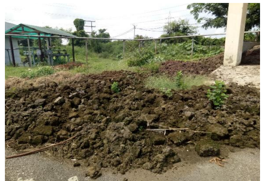
Figure 6: Faecal sludge driving at STP

Treatment/Disposal: JMC has no designated site for the disposal of FS 39 . Therefore in the absence of such provision, the private emptier discharge the faecal sludge along the sub urban areas and farms. There are 35 nullahs carrying wastewater in the city, out of which 15-16 are directly overflowing in the Tawi River. The rest are overflowing in other water bodies and low-lying areas. Since there is no proper treatment of emptied faecal sludge, F5 & S5e is considered 0% in SFD matrix. . There is a proposed FSTP of 167 KLD capacity constructed under AMRUT scheme at Bhagwati Nagar but it is not yet commissioned. Currently, noere is no proper treatment of emptied FS hence, F5 is zero.