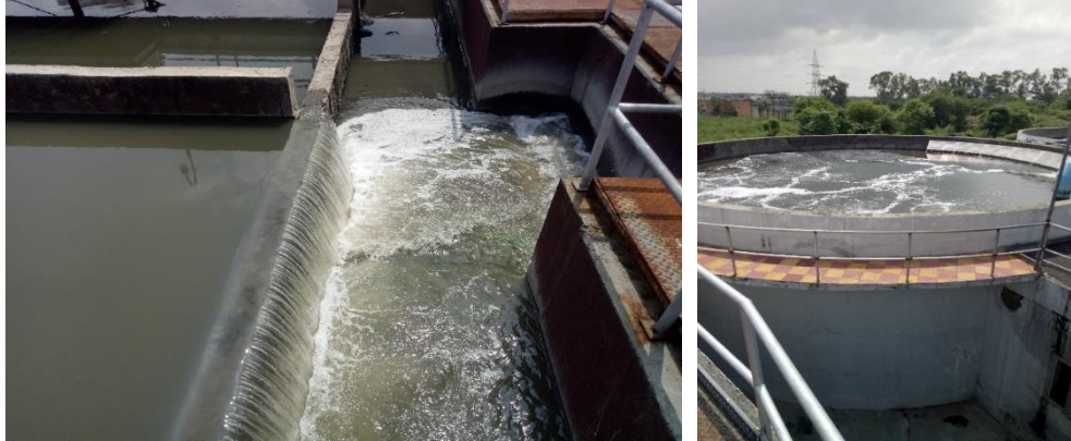
Figure 1: Sewage Treatment Plant in Bhagwati Nagar, Jammu

per the current scenario, ~80% of the wastewater is reaching to the STPs (w4a) considering the defunct sewer lines and leakages which finds its way to either storm water drains and river 14 . There are no seasonal variations observed in the inflow according to the operators 15 . The lab report from the STP revealed that the discharge standards, prescribed by Central Pollution Control Board (CPCB), are met by the plant, hence the wastewater and supernatant treated at the STP is considered 90% (w5a) which is safely discharged into River Tawi 16 . The sludge generated at STP is reutilized for horticulture purpose at plant itself 17 .