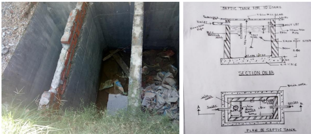
Figure 2: Septic tank under construction (Right) and design of Septic Tank (left)

Containment: Based on sample household survey, KIIs and FGDs with relevant stakeholders, it was concluded that 62% population is dependent on the On-site Sanitation Systems (OSS) 18,19,20 . The two most prevalent OSS in the city are Fully lined tank (FLT) connected to open drain (T1A3C6, 4%) and Septic tank (ST) connected to open drains (T1A2C6, 55%) 21,22 . FLTs are either square or rectangular in shape whereas septic tanks are 2-3 chambered tanks with proper partition walls including plastered bottom 23 . The average size of septic tank is 800 mm x 1000 mm x 1900 mm and fully lined tank is depending upon the household size, income level etc 24 .