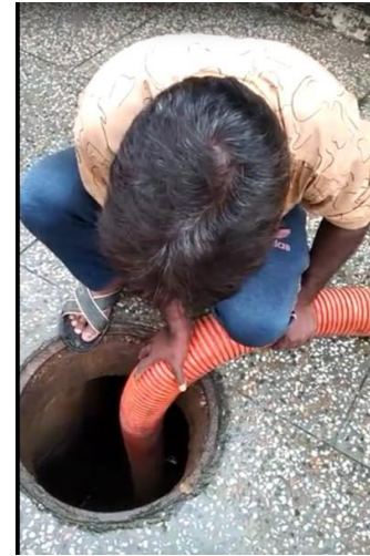
Figure 3: Emptying of faecal sludge by private emptier

Emptying: The city is dependent partly on both public and private desludging service providers for emptying of faecal sludge (FS) from OSS. JMC owns 5 tractor mounted vacuum tankers 28 . There are over 10 private operators with 40+ truck mounted vacuum tankers plying in the city 29 . The vacuum tankers are equipped with a motorised pump with a storage capacity of 5000 to 6000 L .