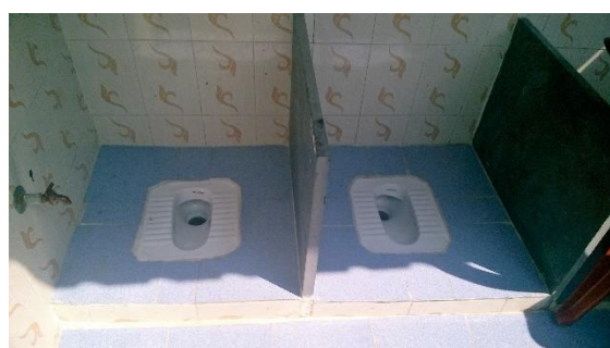
Figure 2.2: Child-Friendly Toilet Seats