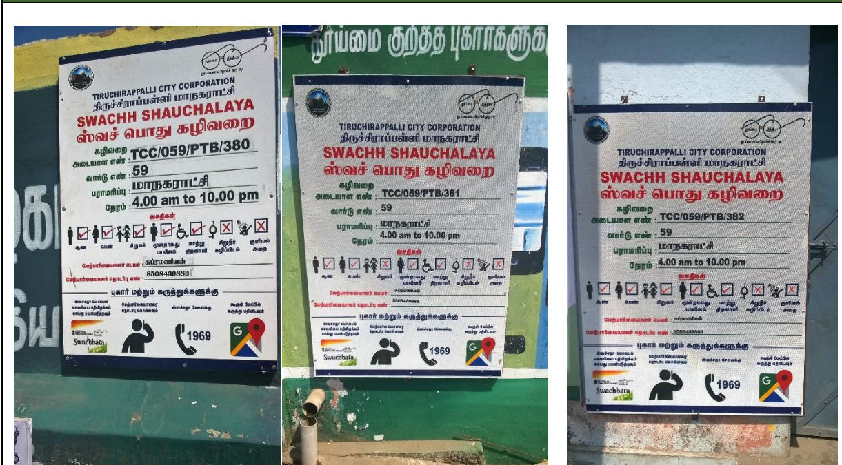
Figure 2.1: Woraiyur Market Complex Toilet Signboards with Unique Identification Numbers