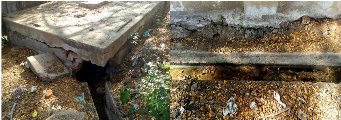
Figure 2.9: Septic Tank Overflow at an FOL in Ariyamangalam Zone Ward 64 – Bhagavathipuram

TCC staff reported issues in accessing a few CT containments, particularly on narrow lanes or roads which are not properly paved. They commonly carry two hose pipes and reported a tendency to allocate lower priority or skip altogether those CTs that require three to four hose lengths to reach the containment.