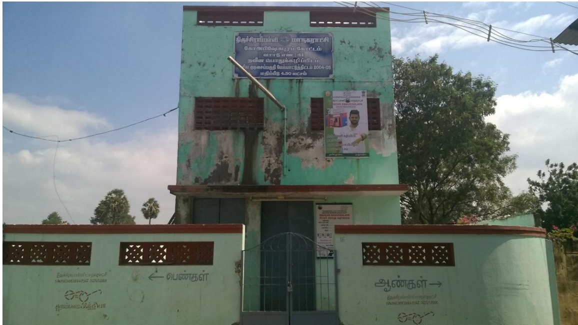
Figure 2.4: Toilet in Ward 41 K. Abhishekapuram Zone in Closed State