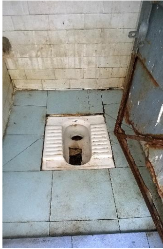
Figure 2.5: Pan Broken Rendering Toilet Seat Unusable