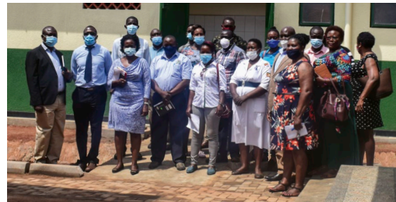
Local partners during an awareness tour at health centres that received new WASH facilities in Kampala