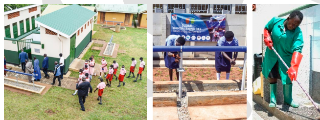
From left to right: New WASH facilities at two schools; A WASHaLOT; Improved maintenance routine