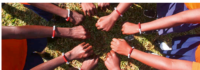
Bracelet campaign at MHM (Menstrual Hygiene Management) Day 2021

According to the Joint Monitoring Programme of the WHO and UNICEF , around 4.5 billion people worldwide still do not have access to safe sanitation. More than 600 million students do not have adequate toilets in their schools and 1.5 billion people use services in hospitals and clinics lacking basic sanitation. According to UNICEF , at least 1,000 children under the age of five die every day from diarrheal diseases caused by contaminated drinking water, a lack of sanitary facilities and poor hygiene. The 2020 Ugandan Water and Environment sector performance report puts access to safe sanitation at 39% (urban) and 7% (rural) and access to handwashing with soap at 61% and 38% respectively. The situation is precarious due to inadequate sanitation and hygiene infrastructure and exacerbated by the continued influx of refugees, internally displaced persons and other vulnerable groups in urban informal settlements. Services along the sanitation chain in most areas are inadequate, insufficient and neither fully regulated nor controlled.