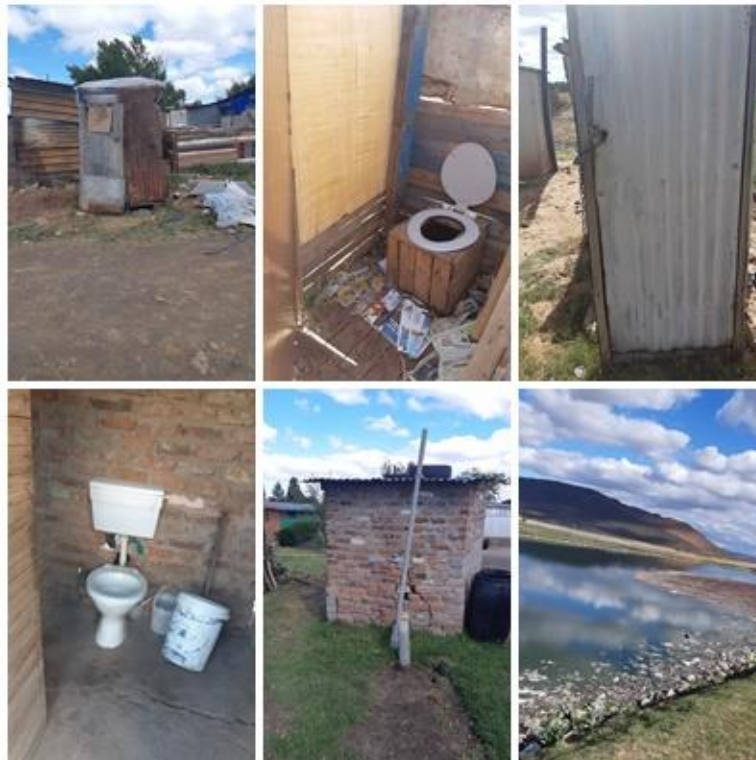
Figure 4: Typical sanitation systems in the targeted area.