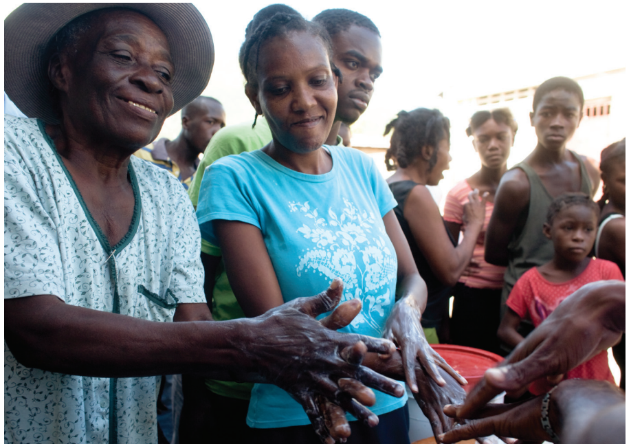
The Eawag research suggests that combining practical demonstrations of hand washing with distribution of hygiene materials has been an effective hygiene-promotion activity in Haiti.

For people affected by disaster, whether wars, earthquakes, or disease epidemics, conditions of life can change suddenly and in ways that require rapid adjustments. Often, adaptation includes taking greater care to prevent transmission of disease, in order to minimize the new threats to public health. Understanding what enables and influences changes in human behavior is key to developing and evaluating strong hygiene programs, so Eawag placed the issue—and the science—of behavior change front and center in its study.