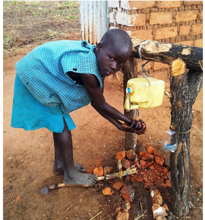
Child demonstrates handwashing in CLTS village in South Sudan

In South Sudan, the programme has slowed down due to the escalation of fighting, but where and when the level of conflict is low, implementation of CLTS continues, with 100 villages targeted in 2015. More flexible and less cumbersome procedures for verification are being developed.