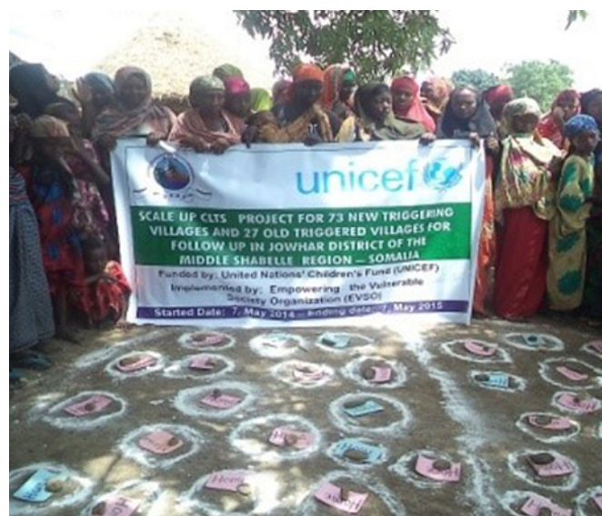
Mapping during triggering in Middle Shebele, Somalia

good. The programme will then gradually move to difficult-to-reach areas with more Al Shabab control in the rest of South-Central Somalia.