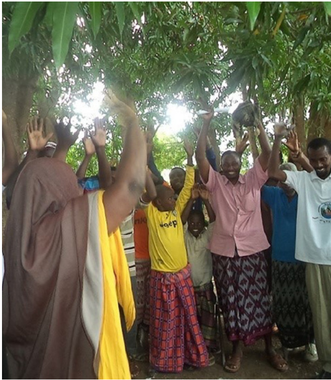
Triggering at a village in South-Central Somalia

Communities were very willing to adopt CLTS but hygiene and sanitation staff from NGOs and government public health staff were much more doubtful about the new approach due to religious/cultural taboos on discussing 'shit'. Their scepticism was overcome by wide involvement of sanitation stakeholders in CLTS triggering activities where doubters could see for themselves how enthusiastically the people engaged in the exercises.