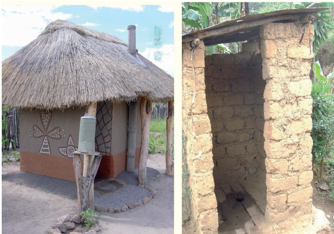
Figure 2. Left: Subsidized ventilated improved pit latrine (VIP) in a CHC home in Zimbabwe with lined pit, concrete slab and vent pipe - a fly trap which eliminates smell and a hand washing facility. Right: An unsubsidized traditional pit latrine in Rwanda, unlined and open pit, log floor giving open access for flies.