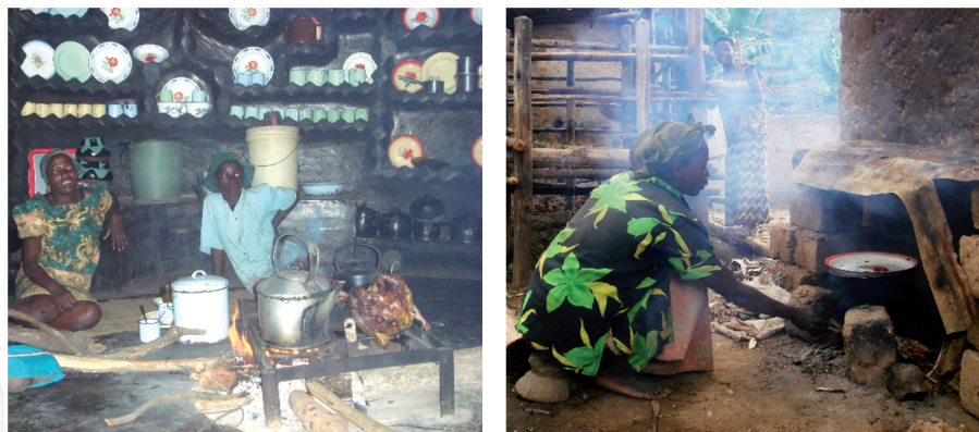
Figure 3. Left: A model CHC kitchen hut in Zimbabwe showing shelving made of clay, individual family utensils and covered drinking water with ladle. Right: In Rwanda, a traditional cooking shelter outside, with no CHC improvements.