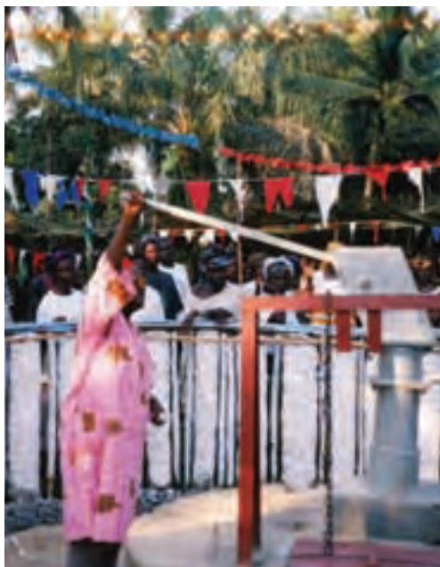
Well opening Sierra Leone.

It should also be remembered that older people have a wealth of experience and knowledge about their communities and can make a significant contribution in both preparing and responding to emergencies: so consideration and thought needs to be given in how to responsibly contact and interact with older people.