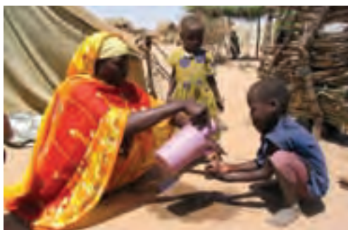
Sudan, Darfur Camp

The community elects volunteers who visit the houses to verify if the house still deserves the award and/or if there are new houses that can fly the green flag. It is hoped that in the future, the community will determine the criteria for a model household. Mapping those households with green flags can be a useful community exercise and can trigger a lot of debate and discussion. ( Oxfam Accountability Case study: 2008 Southern Sudan; Community Participation in Monitoring ).