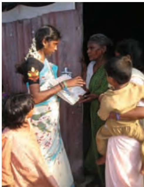
Home visiting