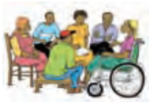
Monitoring and Evaluation Section 5