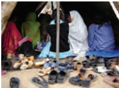
Community Meeting.