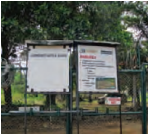
Information board in Liberia.

Communities initially used the ledgers as guest books to record visitors to the community. This made sure that other NGOs were not duplicating efforts but later the communities were trained to use the ledgers to record the movements of project materials. The Committee made sure that any request for materials from project staff details the quantities, output and staff names. This helps to ensure that materials are used for their intended purpose. (Tearfund 2009 personal communication)