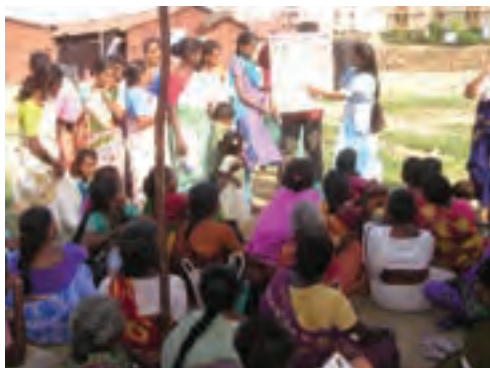
Tsunami Response.