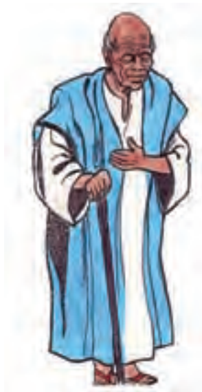
Older people are likely to be disproportionately vulnerable during disasters.

However, some people will be more vulnerable than others and limited resources might mean that aid will sometimes need to be targeted at particular groups and decisions will have to be made by weighing up the pros and cons of each. For example in the case of NFIs, some people may be able to afford to purchase hygiene items but a blanket distribution of soap may be easier to manage and may stimulate increased use which will help to protect the health of the public as a whole.