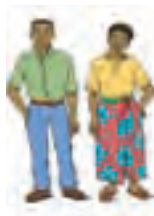
Staff Competencies and Attitudes Section 6