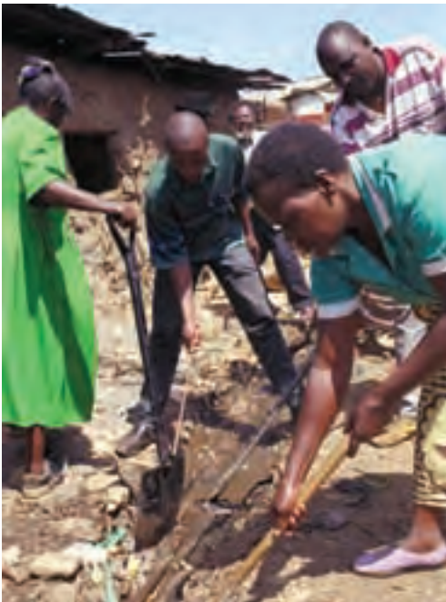
Digging drainage channels.

As part of its Tsunami response programme, HelpAge has produced a detailed social map of all the villages in which it works. Data, collected through village surveys and individual interviews, is represented visually in a series of maps available on CD-Rom. The maps show each house, the type of house (brick, thatch), houses with older people, houses in receipt of programme support and type of activity (e.g. livestock, artisan). Clicking on individual houses gives details of the older person living in that house, including information on health issues. Each social map is available at village level on a 12 x 8 foot canvas. (This idea could be adapted for the WASH sector.)