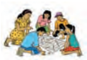
Participation Section 2

Accountability can be seen as having 5 dimensions: