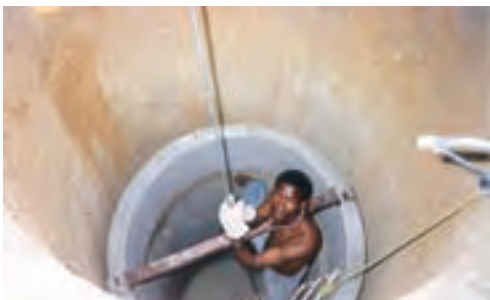
Well construction.