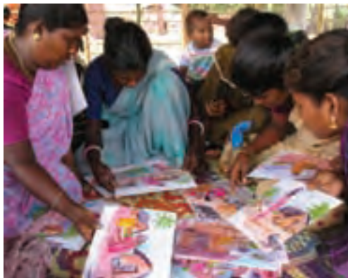
Three pile sorting.

During the response to Cyclone Sidr in Bangladesh, an inventive engineer came up with a useful way to help to manage and resolve complaints. The selection criteria for the provision of shelter was determined in partnership with community groups in order to determine where the priorities were. Photographs were taken of the shelters to be repaired. Several families subsequently complained that they should also have had shelters provided for them. A picture was then taken of their shelter and compared to the shelters of the families that had been selected and this helped to provide both community members and the construction team with a useful way to resolve any differences. (OXFAM personal Communication)