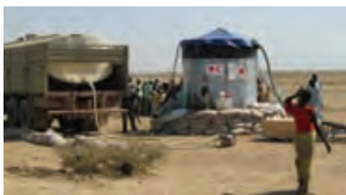
Water treatment and distribution.