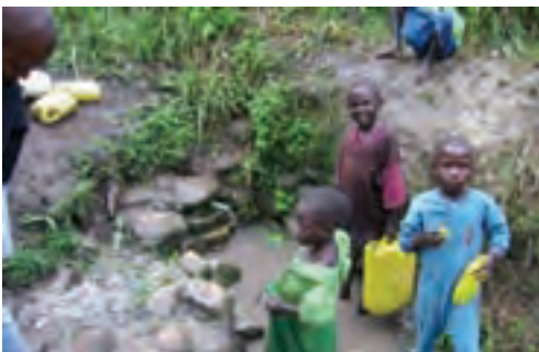
Children collecting water.