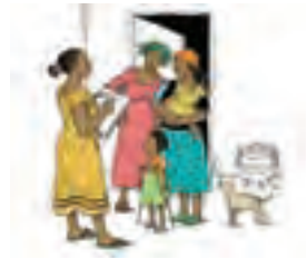
Feedback and Complaints Section 4