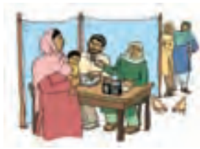
Transparency Section 3