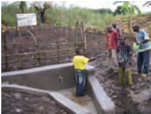
Spring Protection.

www.wsp.org/UserFiles/file/327200744509_saybetter.pdf