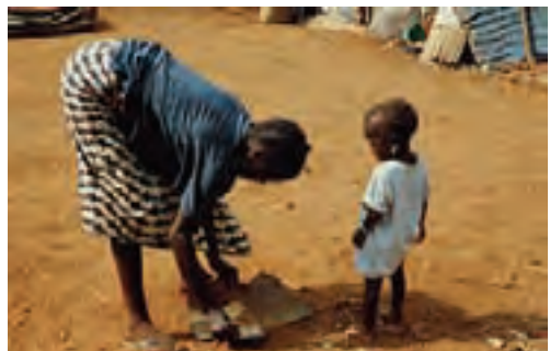
Sierra Leone, IDP camps.