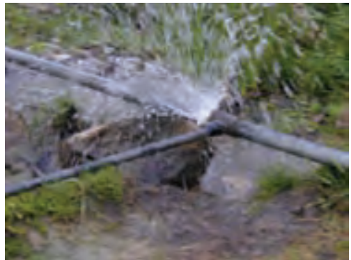
East Timor. Illegal Connections.