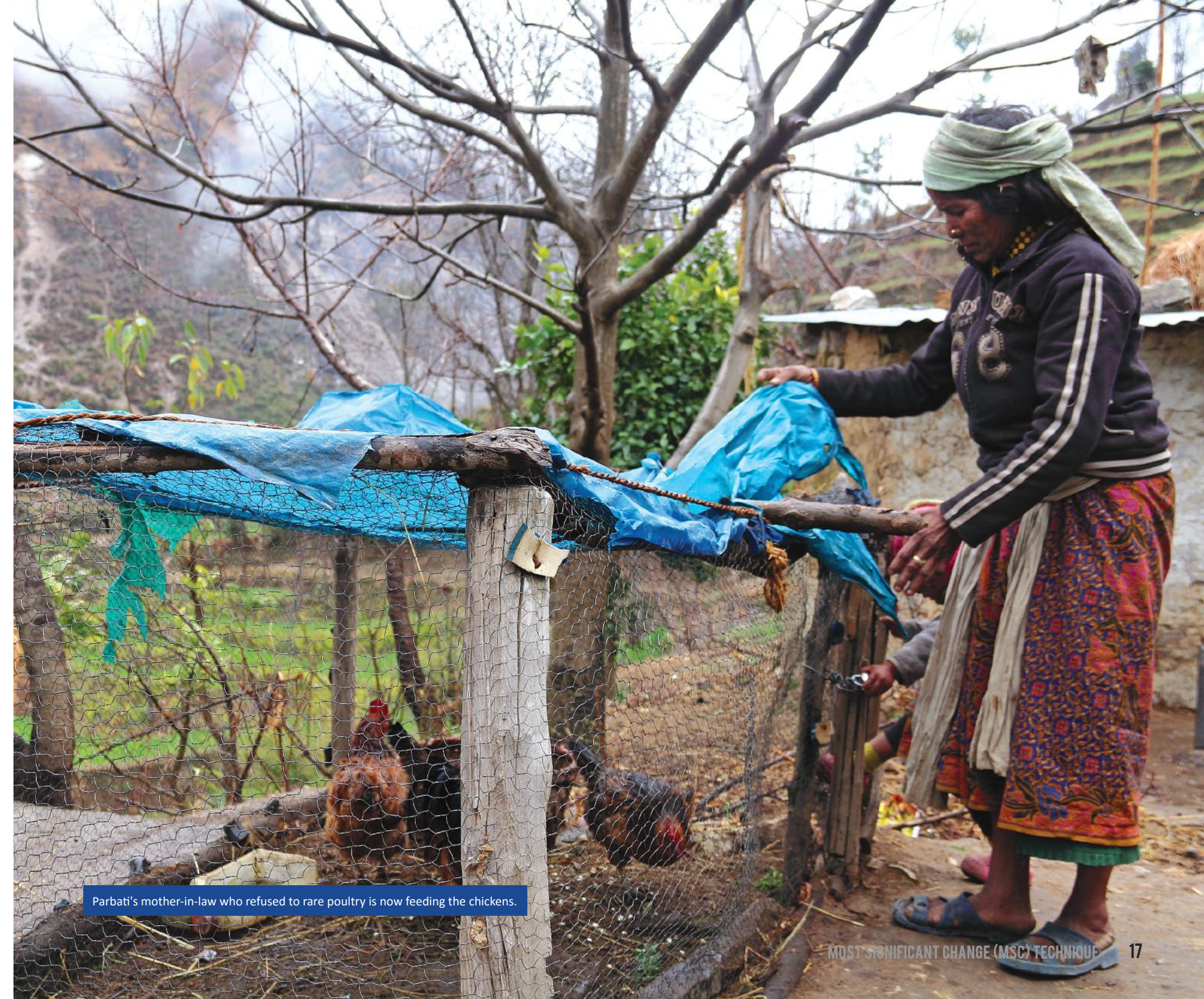
Parbati's mother-in-law who refused to raise poultry is now feeding the chickens.