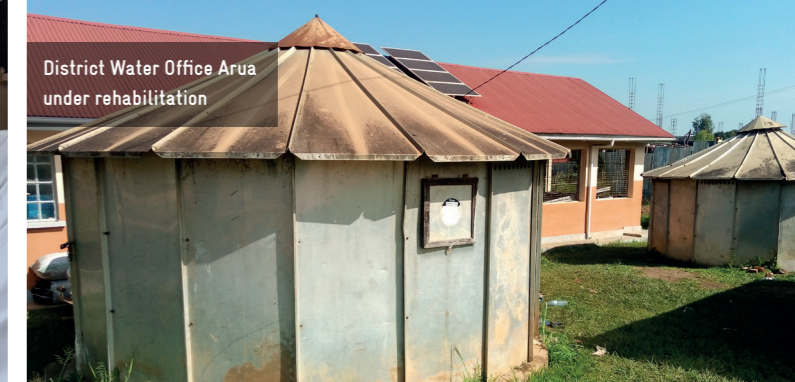
District Water Office Arua under rehabilitation