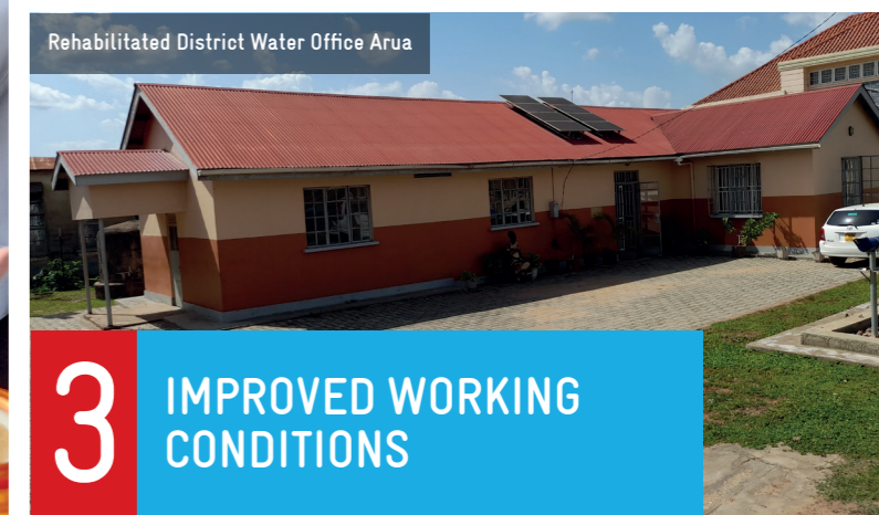
Rehabilitated District Water Office Arua