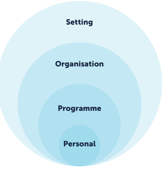
Fig. 2: Levels at which gender equality must be addressed.

We will discuss these levels in turn below. By addressing gender equality at all stages, agencies can develop a comprehensive intervention that systematically focuses on changes at multiple interconnected levels (See Fig. 3 and Table 3 ).