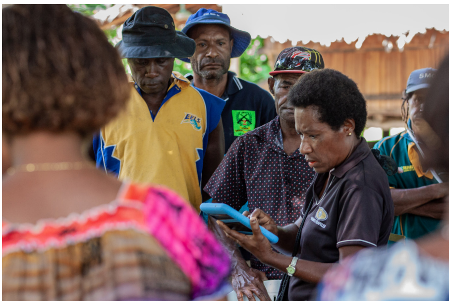
A representative of the East Sepik Provincial Health Authority, and member of the Wewak District WASH Coordination Body, provides training for enumerators as part of the Wewak District WASH baseline

Insights from partner discussions ( Table 2 ) indicate the huge value that CSO engagement in strengthening PMR processes can contribute to shifting the explicit system conditions of policies, practice and resource flows. By engaging with sector PMR, CSOs help to operationalise WASH policies and strategies, make institutional practices routine and optimised, put guidelines into action and influence financial and human resource allocations.