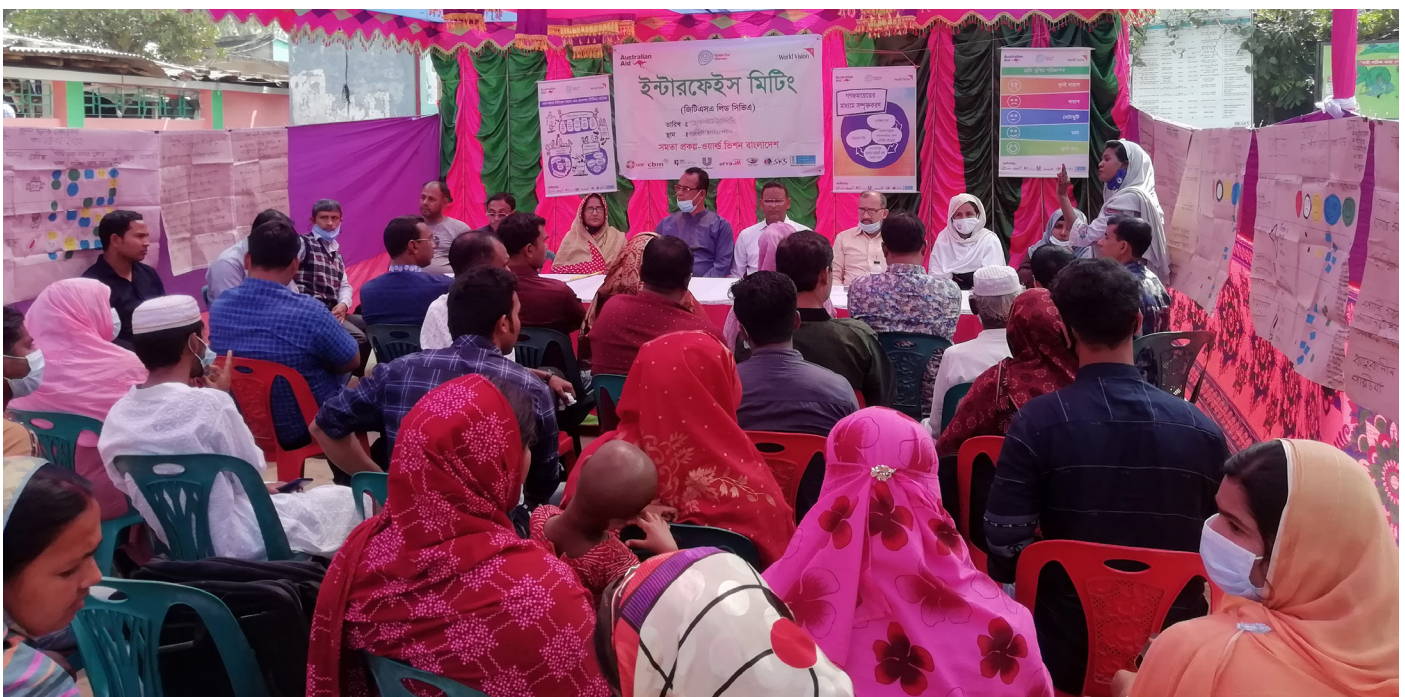
At an interface meeting in Satkhira, WASH status updates are shared shared by the Union Parishad

The Sanitation and Water for All (SWA) framework of building blocks can help to identify the system elements or functions needed in order to deliver WASH services. However, building blocks do not explain how system elements interact or how change within a system can be effected and sustained to overcome systemic challenges like those highlighted above. Exploring how change happens requires a different framing.