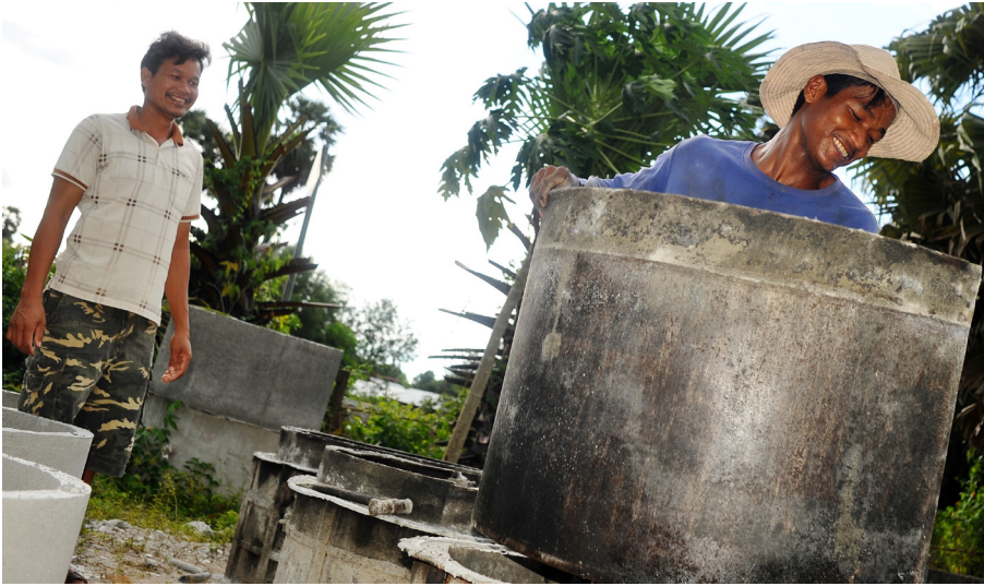
At a manufacturing site in Kampong Chhnang, Cambodia, latrine business team members produce cement rings for pits