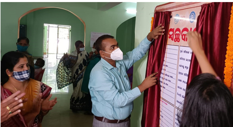
A saniwall designed to track the weekly performance of sanitation services in each ward is unveiled in Bhubaneswar, India

The resulting plans, and the process to develop them, led to more effective decentralised governance with meaningful involvement of community, including the most marginalised, in WASH service planning and monitoring. They also led to regular reviews, sharing of information, and feedback mechanisms to improve accountability and responsiveness of service providers.