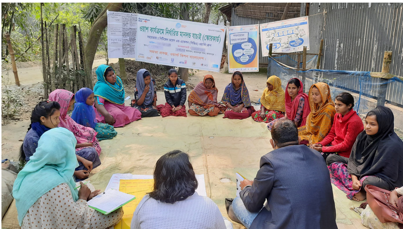
Women and girls review WASH progress in Jamalpur during a score card session

These insights and examples demonstrate that the way CSOs engage with WASH PMR can contribute to significant shifts in mental models and worldviews among other actors. By specifically helping government to link PMR to their own individual and institutional responsibilities, WASH can become a higher priority. By supporting charismatic and influential leaders to lead change, and by creating new relationships and connections between rights holders and duty bearers, CSOs can contribute to changes in how people understand the system and their role within it. These ways of working are especially important for shifting mindsets and norms for more gender equitable and socially inclusive WASH.