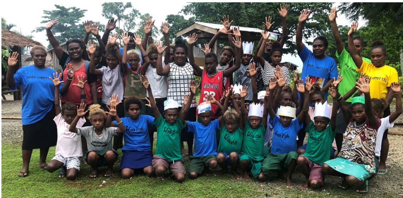
Schools are at the heart of driving efforts to improve hygiene in rural Solomon Islands, where some 6,000 Guadalcanal students have participated in the WASH in Schools program as part of the New Times New Targets project

WASH improvements in schools can help reduce dropout rates and attract new staff. It is reasonable to assume that WASH interventions, either at home or in schools, will reduce illness and subsequently school absence. However, evidence of impact on pupil education has been mixed. WASH improvements alone are insufficient to offset the root causes of absenteeism and dropout; other factors can be more influential (Trinies et al., 2016; Chard et al., 2019). Poor school WASH facilities diminish motivation among teachers, are a major barrier to attracting new staff, and may reduce attendance, particularly of girls.