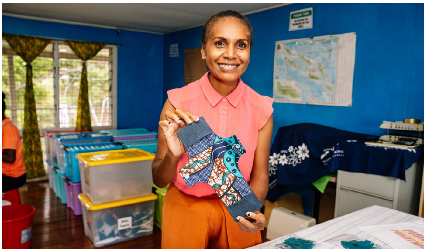
The founder of MJ Enterprise - now known as Kaleko Steifree - presents one of their locally made menstrual pads, which can be reused for two to three years

Customs, beliefs, taboos and shame associated with menstruation remain key challenges. If schools lack separate toilets for girls or toilets have no locks, managing menstruation in schools is difficult (SNV Lao PDR). The cost of sanitary pads in rural areas, and sometimes in urban areas, complicates MHH (HfH Fiji). Shame is a key reason why women and girls prefer not to wash and dry reusable sanitary cloths in public places; girls often lack information on MHH (IRC, Pakistan), and female teachers are uncomfortable in teaching the topic (Pakistan, Bangladesh). World Vision in Vanuatu report that 29% of women with disabilities and 18% of women without disabilities in Sanma and Torba Provinces miss social activities when they menstruate. 9 In Fiji, teachers from Naviti Primary School collaborated with Sunday School teachers to deliver consistent and positive MHH messages. This seems an effective partnership and a great way to make progress on a sensitive topic.