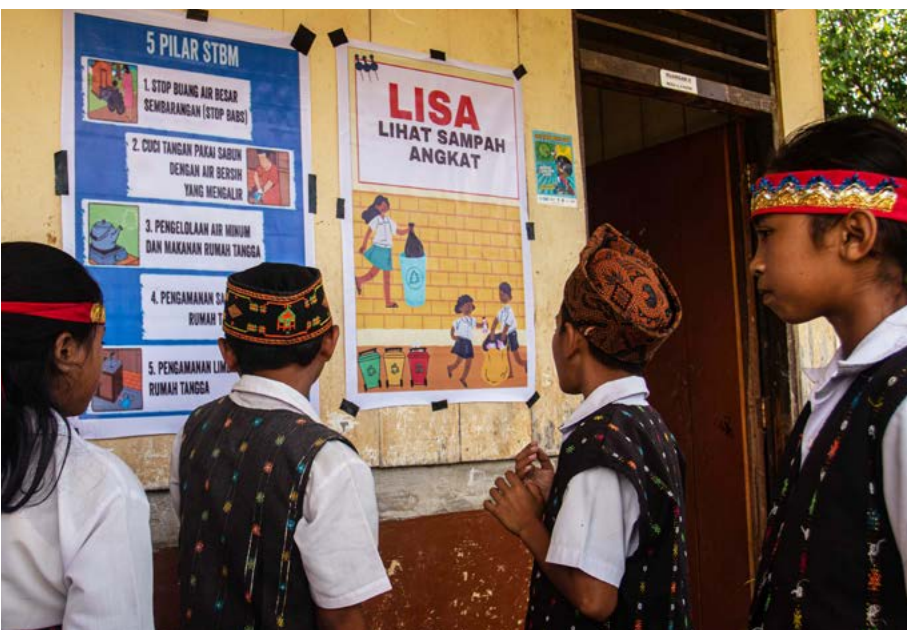
Students at an elementary school in Manggarai, Indonesia, explore posters that display five important steps in managing their WASH needs and waste management at school — part of a behaviour change campaign delivered by Plan International's Water for Women project, WASH and Beyond: Transforming Lives in Eastern Indonesia

Water for Women partners continue to build on and learn from WinS practice, which has evolved over the life of the Fund. The highlights, achievements and lessons in this brief provide a snapshot of this important area of inclusive and sustainable WASH that in turn provides a critical foundation for equitable education, health, and wellbeing.