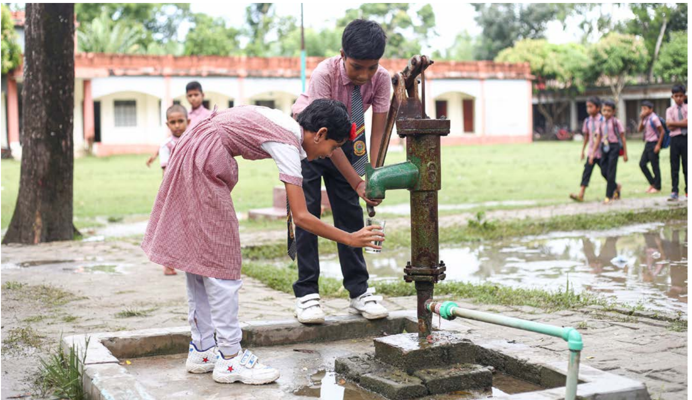
At a primary school in Satkhira district, Bangladesh, students access drinking water from a hand pump installed by World Vision

The education sector plays a very important role in strengthening WASH in Schools collaboration and synergies.