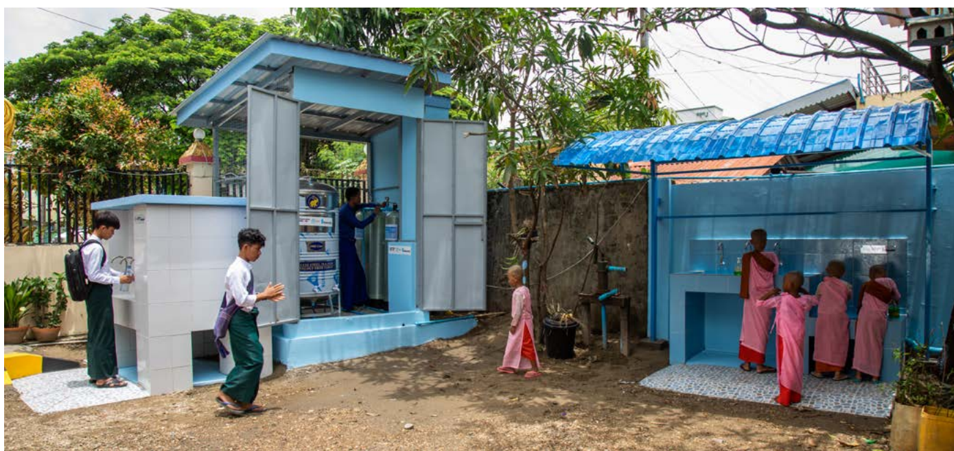
Students at a community-run school in Myanmar access handwashing facilities and water drinking stations installed by WaterAid as part of the Myanmar Humanitarian WASH project

There is scarce private sector funding (e.g. concessional financing/loans, public-private partnerships, development impact bonds) or other innovative financing mechanisms available for rural WinS in Water for Women projects, perhaps due to remote rural locations of projects, high cost of WinS, logistical challenges, and poverty of the population.