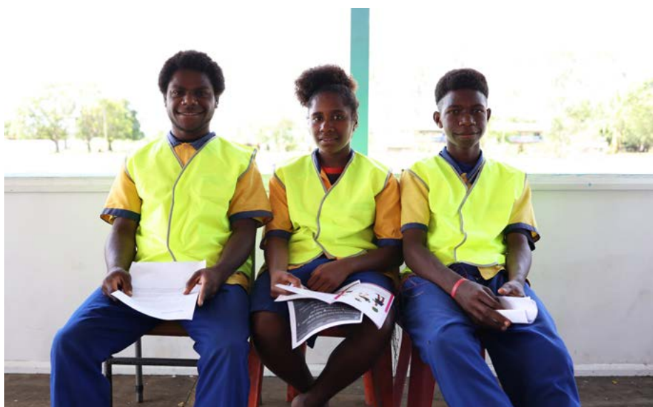
Members of the student WASH Club at a primary school in Markham District, PNG, promote good WASH practices among their peers

The COVID-19 pandemic has exacerbated longstanding inequalities in access to quality education. Full or partial school closures and other factors reduce the health and wellbeing of children, their families and educators. WinS activities were affected by COVID-19 and a number of strategies implemented to manage associated challenges during closures and once schools reopened.