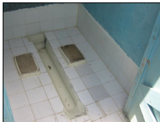
FIGURE 1. TILE FLOORING WAS USED FOR THE URINAL IN ATONO PRIMARY

Findings in this report have been divided into three main categories including: infrastructure, logistics and socio-cultural factors. Sub-headings appear beneath broader themes. Overall, this research found that urinals are popular with primary school-aged girls. Barring excessive messes or odors, female students report using the urinal an average of two times a day. Daily maintenance and infrastructure repairs are problematic.