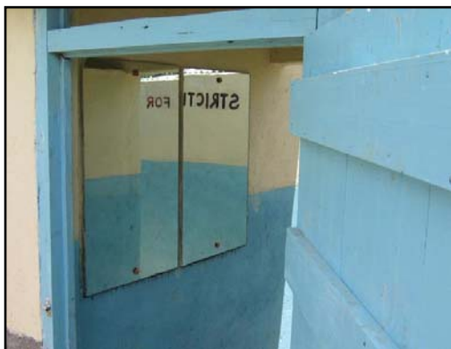
FIGURE 2. MIRRORS WERE PLACED IN ATONO PRIMARY.

The design of the urinal itself was described as “good” by students as the foot pads prevent urine from splashing on their feet.