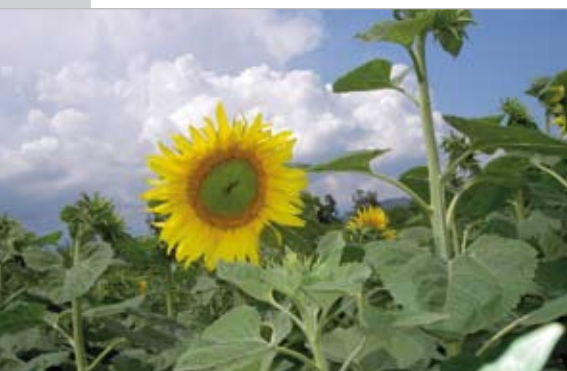
Figure 4: The reuse of sanitised human excreta in agriculture often falls outside of the existing regulatory legal framework

The specific benefits of the closed loop approach should be communicated and promoted in such a way that the advantages of ecological sanitation, compared to other available sanitation systems and approaches as well as to the “business as usual” alternative, become very clear to decision-makers and politicians.