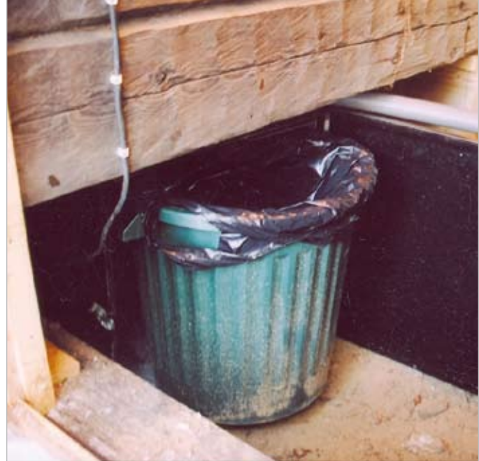
Figure 12: Plastic container for collection of faeces, lined with a black plastic bag.

Great care should be taken and the regulations issued by the proper authority on occupational safety and health should be followed if it is necessary to go down into the urine tank, and this task should never be undertaken by one person alone.