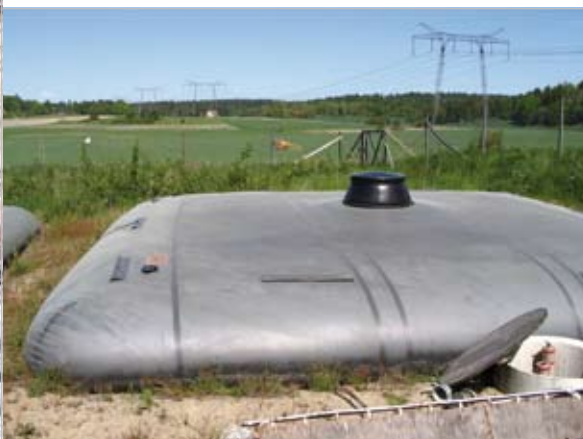
Figure 11: Rubber tanks for storage of urine