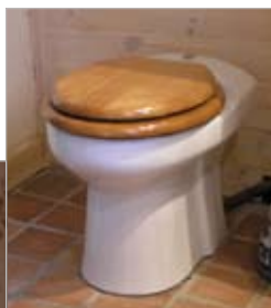
Figure 22: Photographs of WM-Ekologen single flushing toilet.