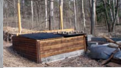
Figure 26: The faeces are composted in a closed bin together with grass and leaves.