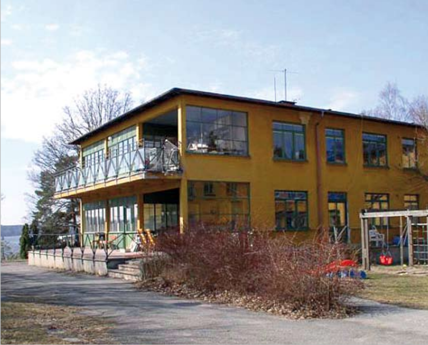
Figure 24: Gebers, once a convalescent home, is today a modern apartment house close to lake Drevviken.