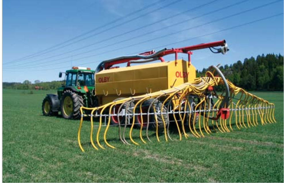
Figure 16: Large scale application of urine using a slurry spreader with trailing hoses.