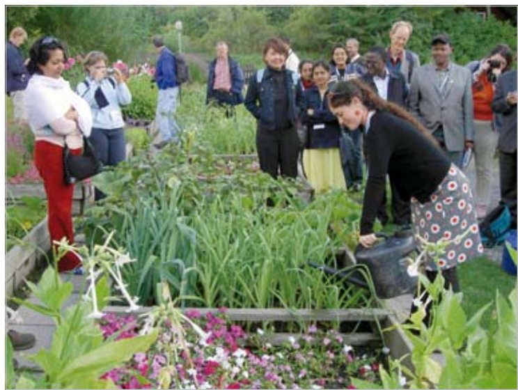
Figure 15: Visitors apply urine in a demonstration garden in Sweden

A hypothetical household with a dry urine diverting toilet system collects 1500 l of urine per year. The nutrient content in the urine is 7 g N/l, 0,7 g P/l and 3,5 g K/l. There are many other nutrients in the urine, such as sulphur and micronutrients, but the N, P and K are easiest to calculate with. The amount of N and P in the 1500 l is 10.5 kg N, 1 kg P and 5 kg K. The cost of a mineral fertiliser for the garden on the market in Sweden is 149 SEK for a 20 kg bag containing 3,6 kg N, 0,8 kg P and 2 kg K. A rough conclusion of the value of the urine is that it corresponds to two bags of mineral fertiliser or 300 SEK (27 Euro).