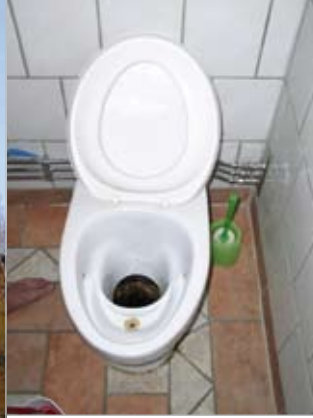
Figure 25: The sanitation system is unique; a urine diversion system with dry collection of feces in a 2-storey building.