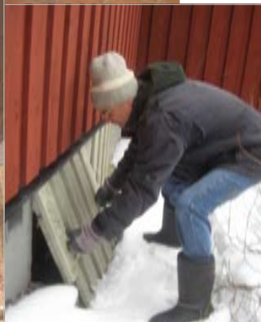
Figure 23: The faecal collection container is accessed from the outside of the house.