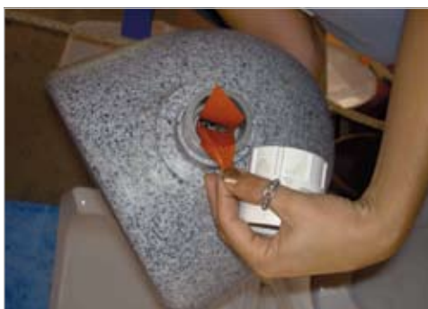
Figure 6: Rubber membrane as odour seal.