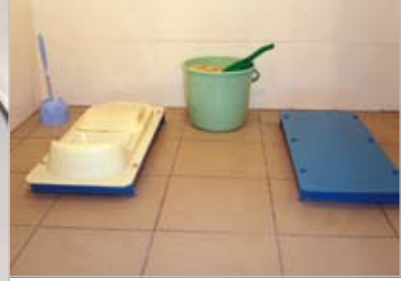
Figure 2: A urine diverting toilet seat.