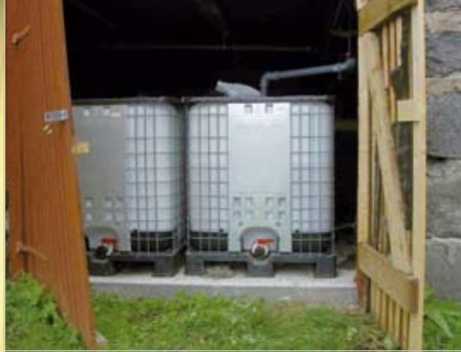
Figure 9: One cubic meter tanks suitable for storage of urine.

efficiently as caustic soda, but it is more efficient in dissolving some of the mineral precipitates. Enough acid should be used to completely fill the u-bend and part of the pipe immediately behind it, normally at least 0.5 litres should be used. Also the acid should be allowed to sit over night and the pipe then flushed with at least 2 litres of water.