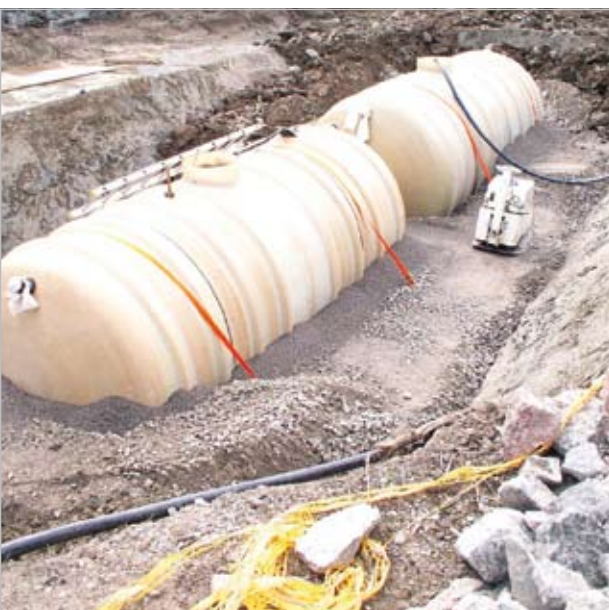
Figure 10: Urine tanks for a neighbourhood during construction in Kullön, Vax- holm.

Most of the urine that is collected in small systems around Sweden is transported to farms where it is poured into the slurry storage. This is a simple way of handling small fractions of urine, however if one wants to make use of the nutrients in an efficient way and there are larger amounts available, designing storage and spreading according to nutrient potential in urine is better.