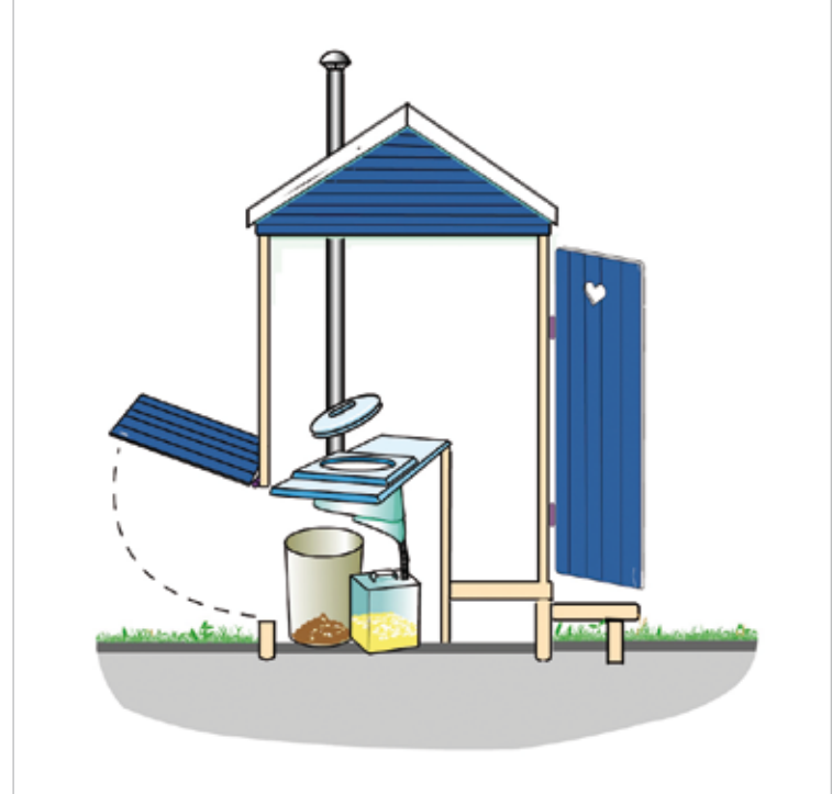
Figure 5: Urine-diverting liner for dry urine diverting toilets in summerhouse settings. By Palmcrantz and Co