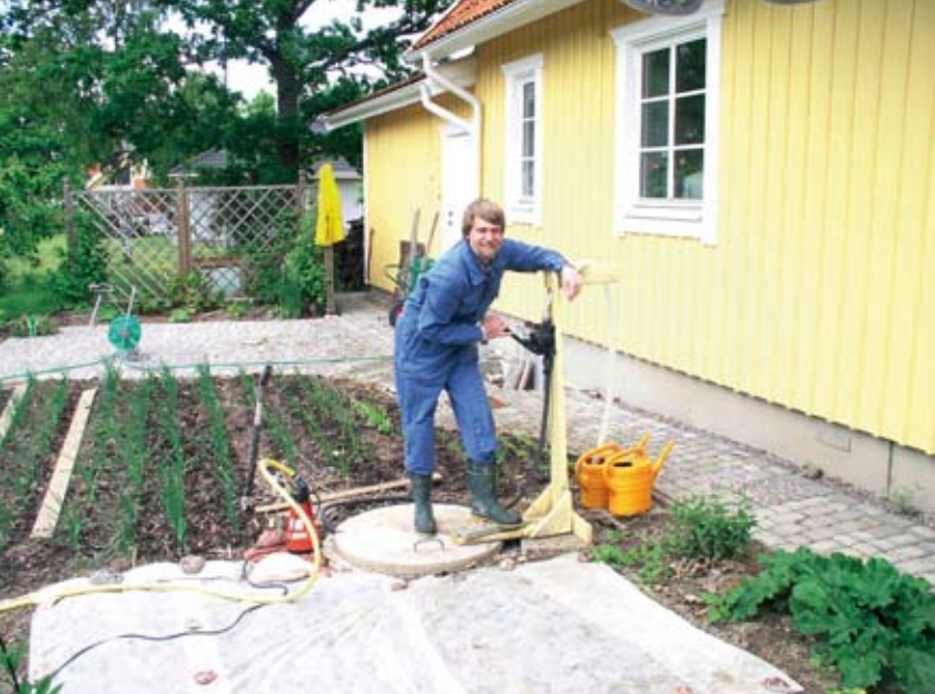
Figure 8: Hand pumping of urine from household tank for subsequent use in garden.